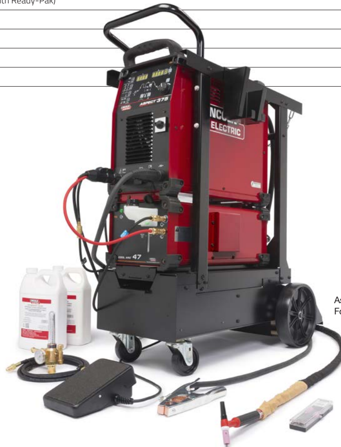
Aspect 375 Ready-Pak with Foot Amptrol™ Shown (K3946-2)