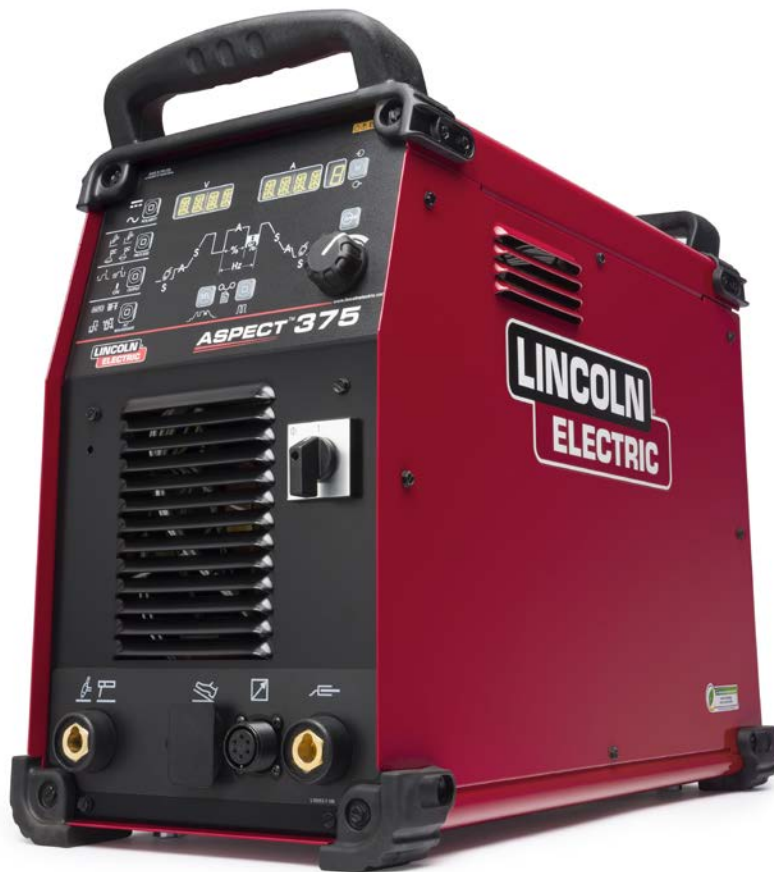
Base Model Shown (K3945-1)