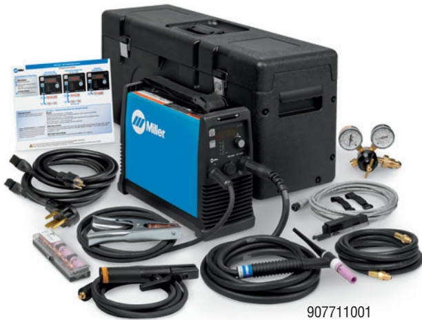
90771001 package shown.