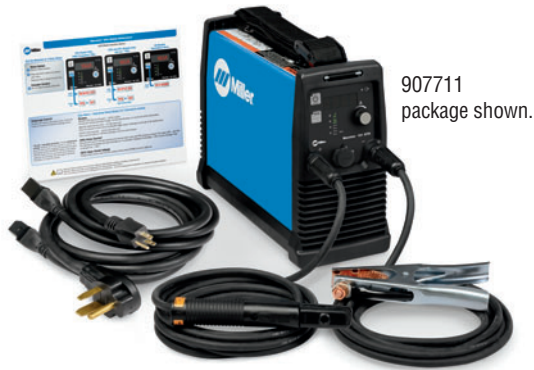
907711 package shown.