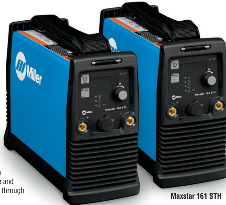
Maxstar 161 STL

Built-in gas solenoid eliminates the need for a bulky torch with a gas valve.